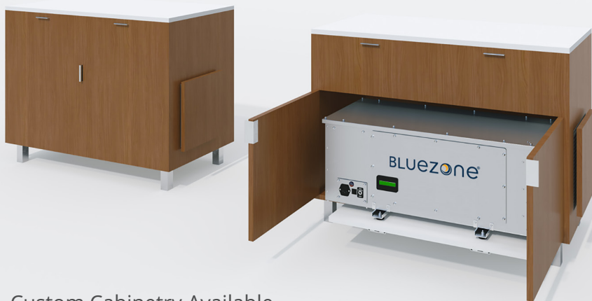
Custom Cabinetry Available

Bluezone Ceiling Mount Kit installed into two, 2' x 2' tiles.